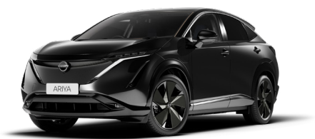
Pearl Black #