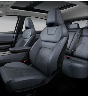
Blue Nappa Leather * . Standard on EVOLVE.