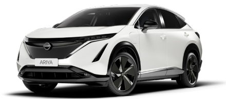
White Pearl †