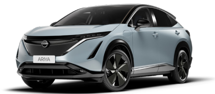
Ceramic Grey with Black Roof #-