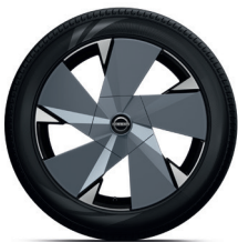
20" alloy wheel with aero cover Standard on: EVOLVE