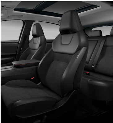
Black cloth. Standard on ENGAGE.