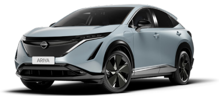
Ceramic Grey #