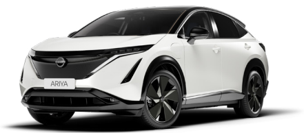
White Pearl with Black Roof #-