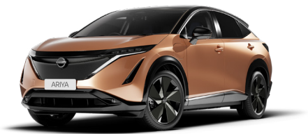
Akatsuki Copper with Black Roof #-