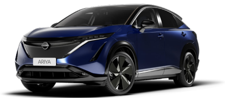
Blue Pearl with Black Roof #-