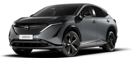
Gun Metallic #