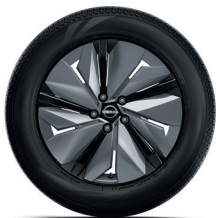
19" alloy wheel with aero cover Standard on: ENGAGE, ADVANCE, ADVANCE+