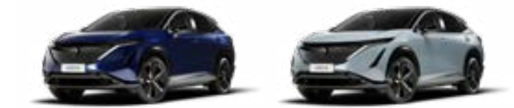
Blue Pearl - P Ceramic Grey - P