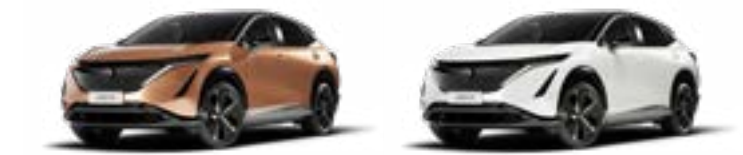
Akatsuki Copper - M White Pearl - P

19" ALLOY WHEELS WITH AEROCOVER STANDARD ON ENGAGE, ADVANCE, ADVANCE+