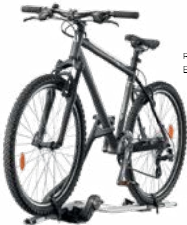
Roof Mounted Bike Carrier

More comfortable. More capable. More you. Choose from a wide range of accessories to enhance your style and protect ARIYA. From Towbar to Styling items, Exclusive Mats and much more to emphasise ARIYA's timeless Japanese futurism throughout this crossover EV.