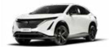
White Pearl - P