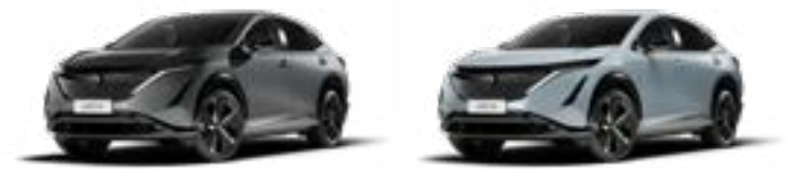
Gun Metallic - M Ceramic Grey - P