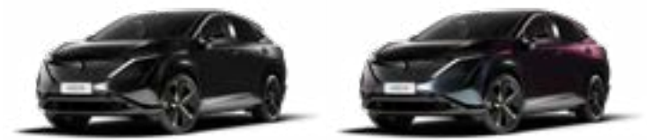
Pearl Black - P Aurora Green - S